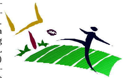
Kicking off the New School Year.

LEA Representatives selected components of the comprehensive strategic plan in order to provide drafts for consideration at the September meeting. It is the intent of the Collaborative to be even more formally structured than in past years. Development of the strategic plan will provide a blueprint by which the organization will function.